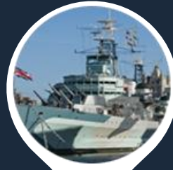
2018 – LONDON HMS Belfast