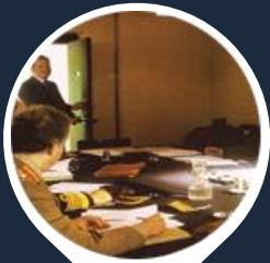
2015 – LONDON Cabinet War Rooms