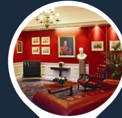
2020 – LONDON Army & Navy Club