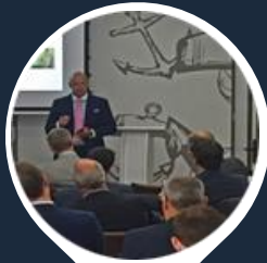
2016 – LONDON St Dunstan's Lane