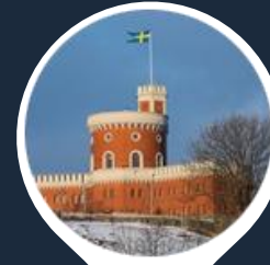
2019 – STOCKHOLM Stockholm Kastellet